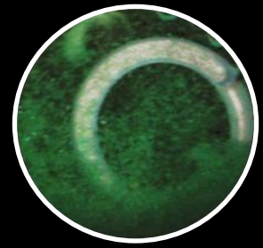
Liquid / Solid